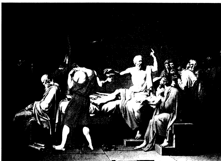
The Ancient Greeks had a different attitude to suicide

Having more than three physical illnesses and a history of peptic ulcer disease in a population sample of community dwelling residents aged over 85 years