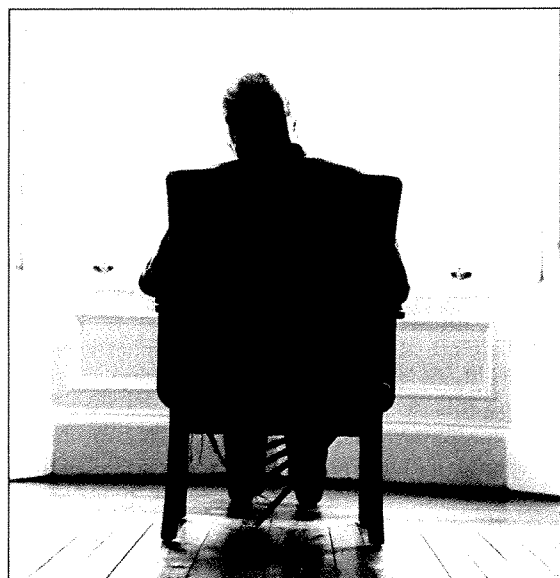
Social isolation in elderly people can have devastating consequences

Although several social factors associated with suicide in elderly people are non-modifiable, they may give clues as to the underlying biological processes involved in suicidal ideation and behaviour. For example, the increased vulnerability of elderly men to bereavement and physical illness may be mediated by relatively higher levels of cerebrovascular disease and alcohol use disorders compared with elderly women.